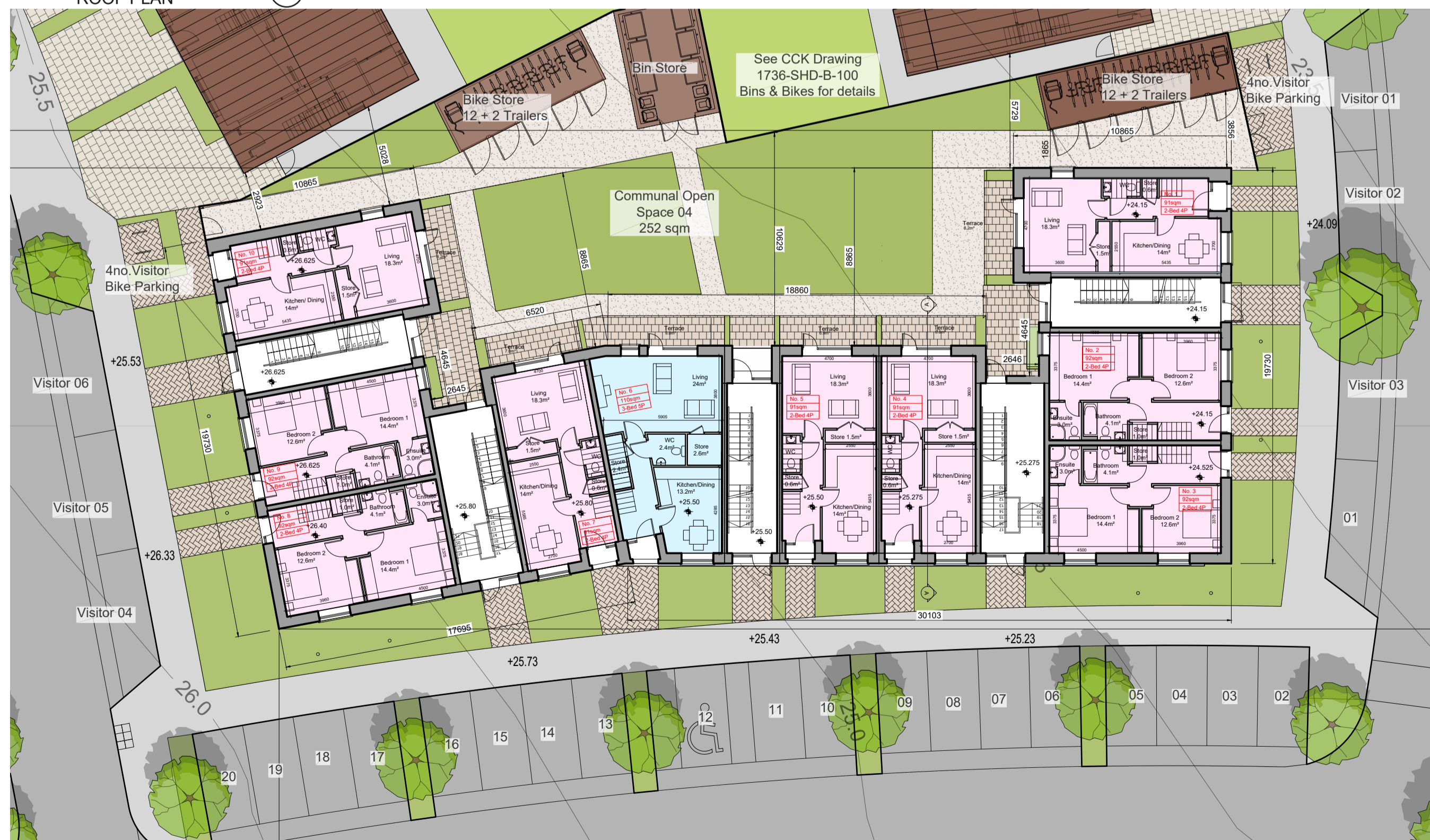
DUPLEX BLOCK D GROUND FLOOR PLAN