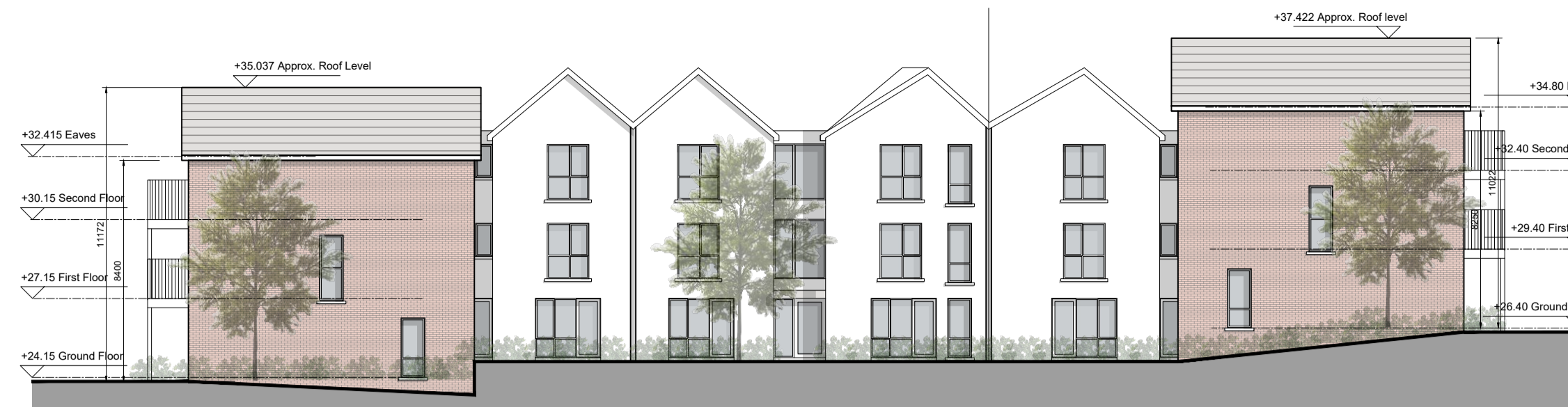
DUPLEX BLOCK D WEST ELEVATION (REAR)