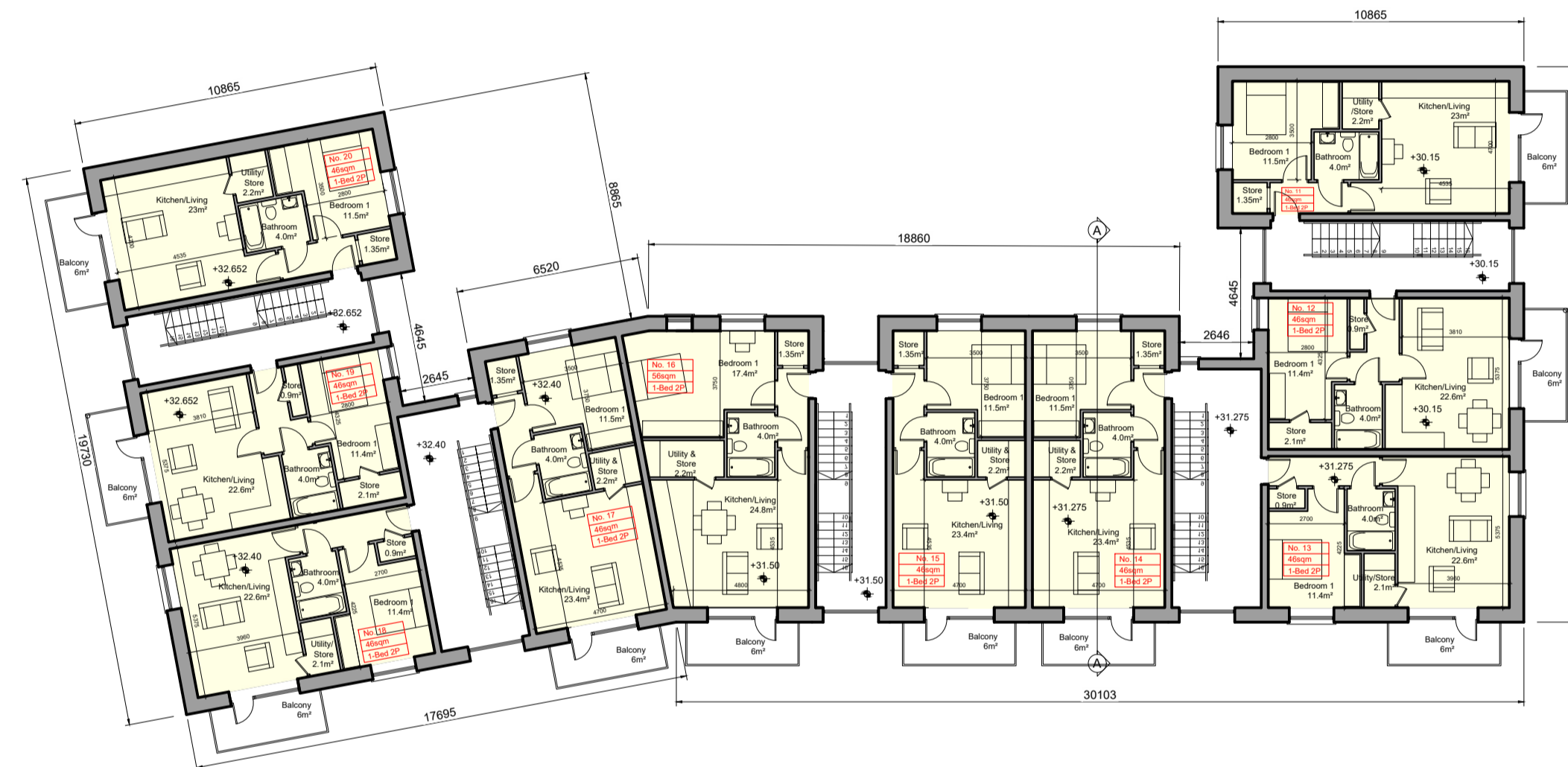
DUPLEX BLOCK D SECOND FLOOR PLAN