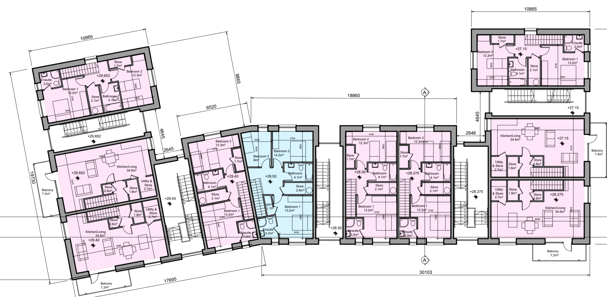
DUPLEX BLOCK D FIRST FLOOR PLAN