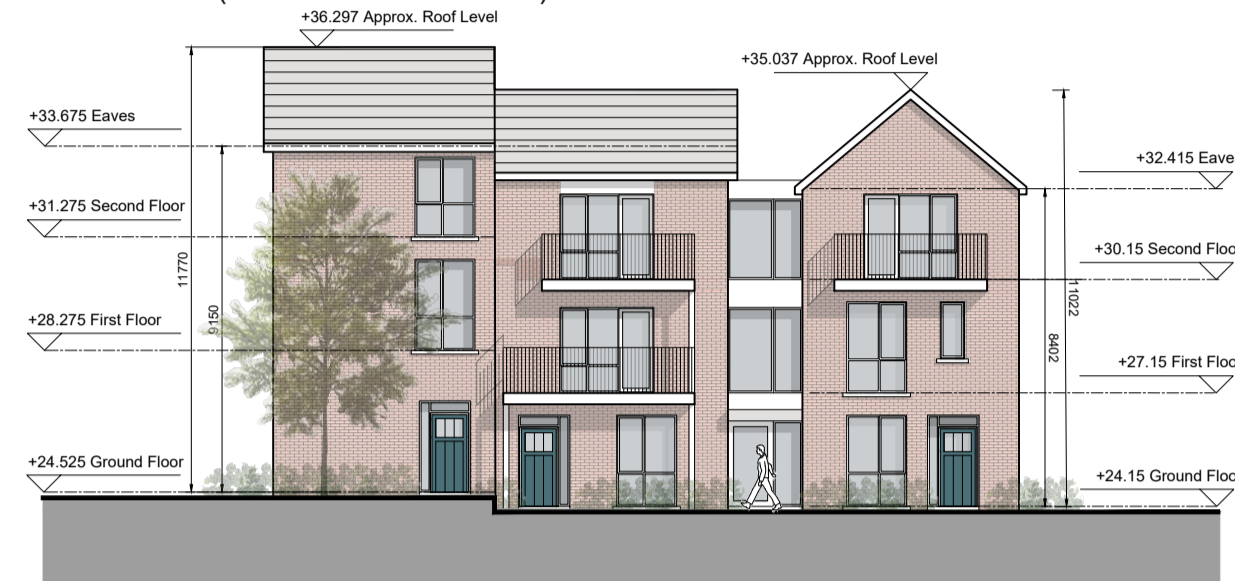
DUPLEX BLOCK D NORTH ELEVATION (STREET ELEVATION)