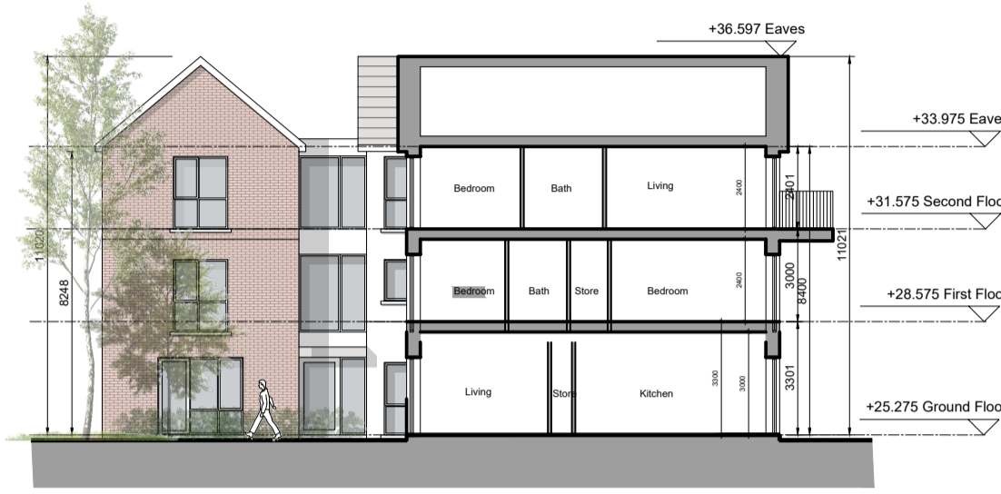
DUPLEX BLOCK D SECTION A-A