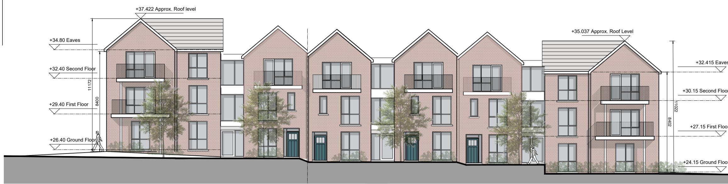
DUPLEX BLOCK D EAST ELEVATION (STREET ELEVATION)