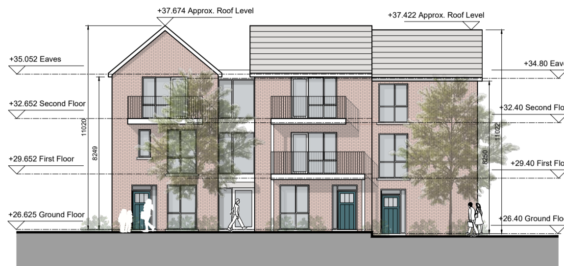
DUPLEX BLOCK D SOUTH ELEVATION (STREET ELEVATION)